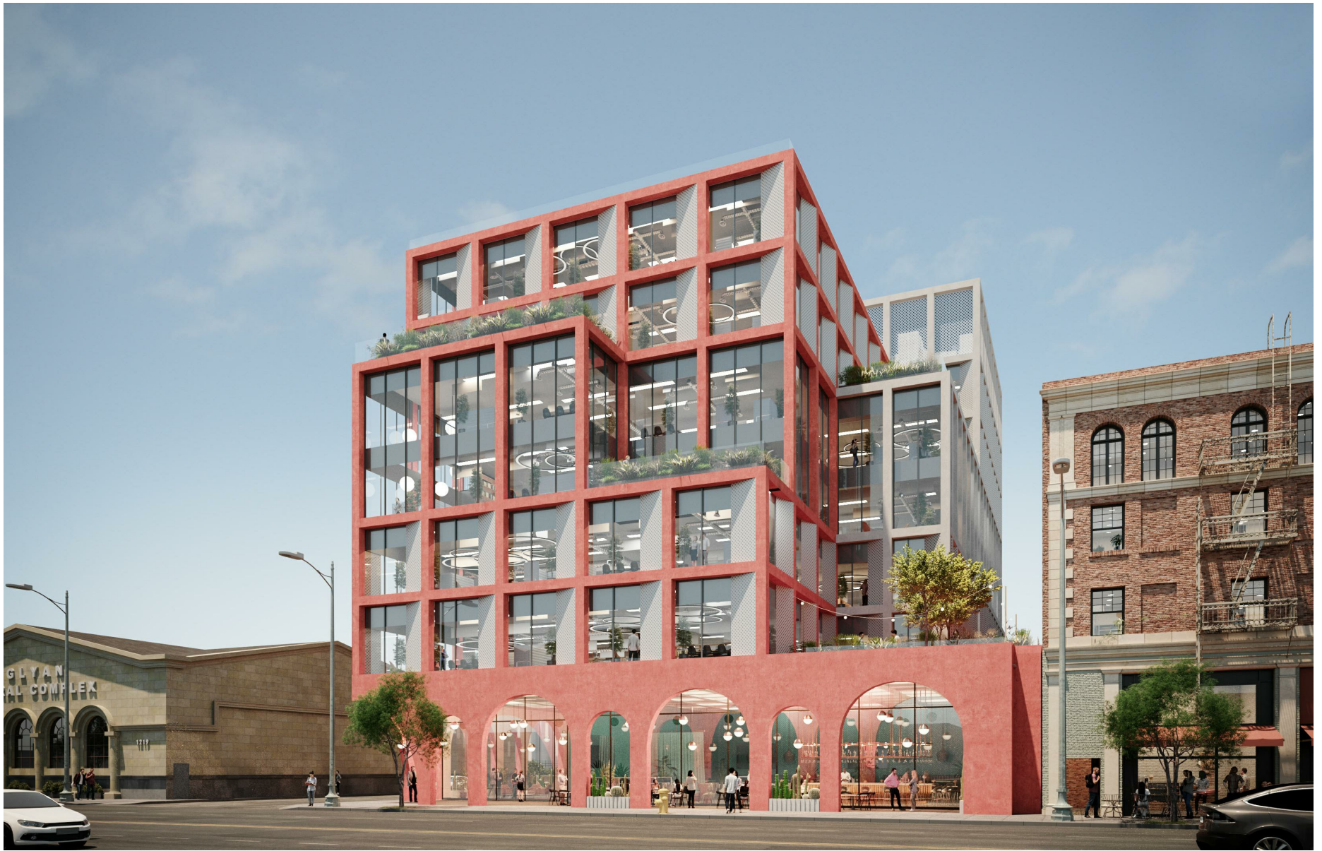
Figure 4 Conceptual Rendering